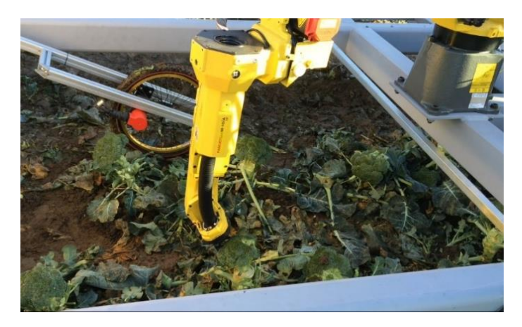
Robotic arm pointing to correct sized broccoli head during field trials.

The robot is designed to work in a wide range of temperatures and can move in six axes of freedom. This means that it can be moved forwards, backwards, sideways, up and down as well rotated around all the directions of movement. In other words, it is highly manoeuvrable and it this dexterity that enables it to mimic human actions.