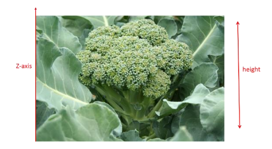
Accurate determination of the height (z-axis measurement) above the ground can also be obtained.

This document is protected by copyright. No part of it should not be reproduced or shared for commercial gain without the written permission of KMS Projects Ltd.